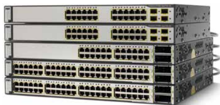
Consistent network hardware

Reduced downtime with plug and play replacement that does not require specialist fibre optic splicing skills