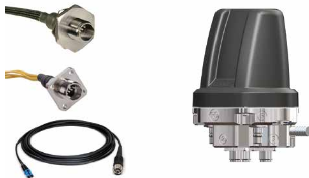
H3RO system components